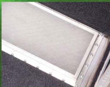
Proprietary honeycomb filter mounted on the bottom of the frame.