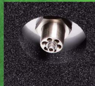
Fiber wave guide as seen from inside the R6 cabinet.

Because of the proprietary design of the Equipto Electronics R6 enclosure, please contact us for more details.