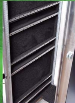
Interior mounting rails are adjustable and available with punched, threaded or square holes.