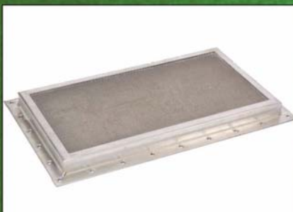
Honeycomb filter is available in choice of .5", .625", and 1" depths