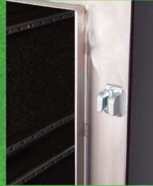
Unique door frame and lock receptacle insure leak-proof closing.