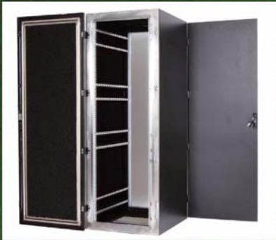
Enclosure can be manufactured to your requirements including choice of front, rear or front and rear doors, panels or combination.