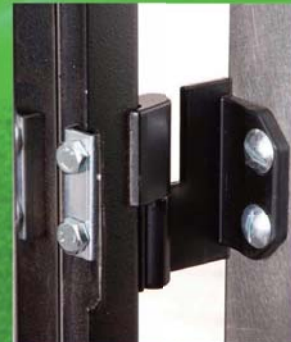
Hinge design allows easy removal of door when opened.