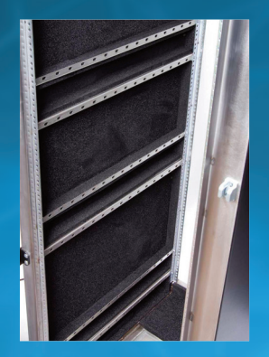
Interior mounting rails are adjustable and available with punched, threaded or square holes.