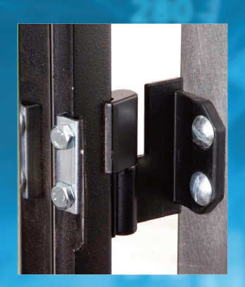
Hinge design allows easy removal of door when opened.