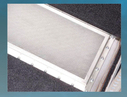
Proprietary honeycomb filter mounted on the bottom of the frame.