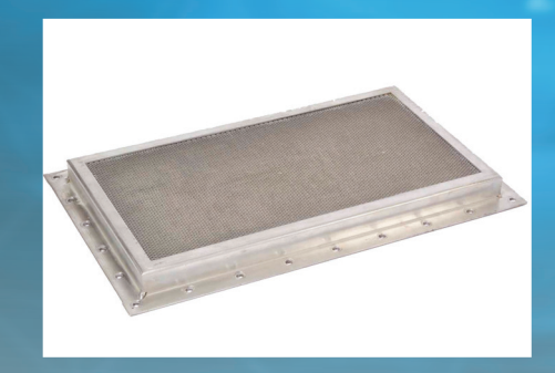
Exclusive honeycomb filter is available in choice of .5", .625", and 1" depths