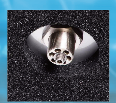
Fiber wave guide as seen from inside the Ka Shield cabinet.