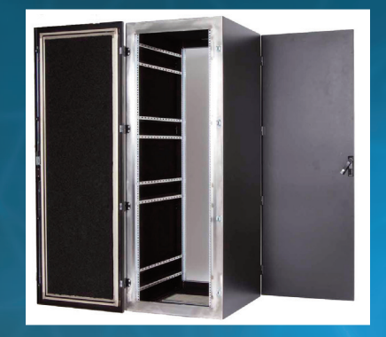
Enclosure can be manufactured to your requirements including choice of front, rear or front and rear doors, panels or combination.