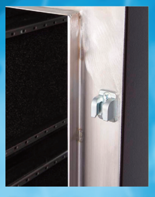
Unique door frame and lock receptacle insure leak-proof closing