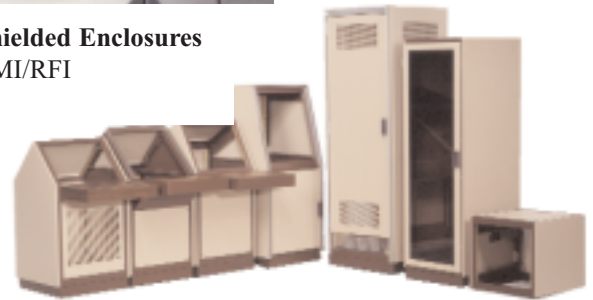
Challenger Economy, versatility, modularity