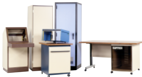
Express 5 Day Service When you need it fast!