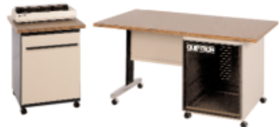
Work Stations Functional to increase productivity