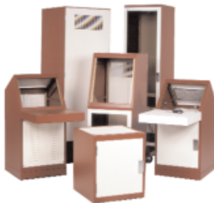
Solid System Cost-saving, non-removable side panels