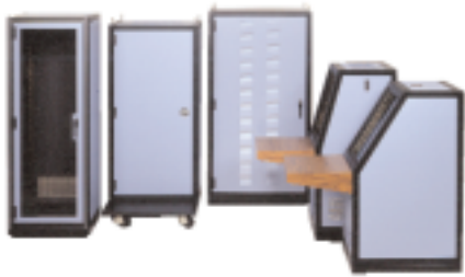
Heavy Duty Total quality, our top-of-the-line