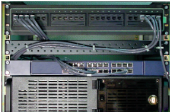
Equipto Electronics offers total or tailored electronics packaging to make your job easier. By partnering with us you benefit from our engineering, purchasing, manufacturing, assembly and testing experience.