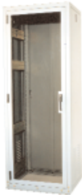
Earthquake Reinforcing Seismic hardened to Zone 4