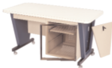
Desk Systems Specifically engineered for electronics