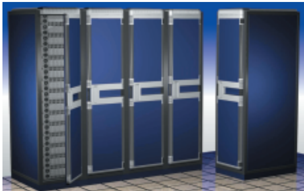
Visualization tools utilized by Equipto Electronics engineers can show how custom enclosures will look before actual prototyping. This allows multiple designs to be reviewed with the time and expense of actually producing prototypes.

*Equipto Electronics unique "Engineering Evaluation Program" makes our standard products available for evaluation at your facility for 30 days. Depending on your needs, we may even provide the product for destructive testing. Contact us to discuss this unique program.