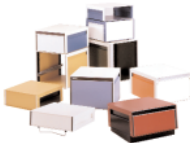
Instrument Cabinets Eye-appealing with strength, modularity