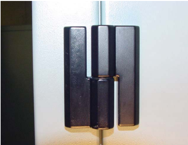
New Flush Hinge