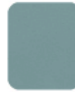
013 Light Gray (F5595A-26329)