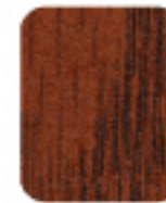
Oak - 3