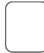
Eggshell - 1