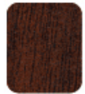
Walnut - 2