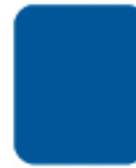
101 Royal Blue (F5595A-25102)