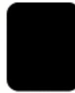
051 Black (F5A595A-27038)